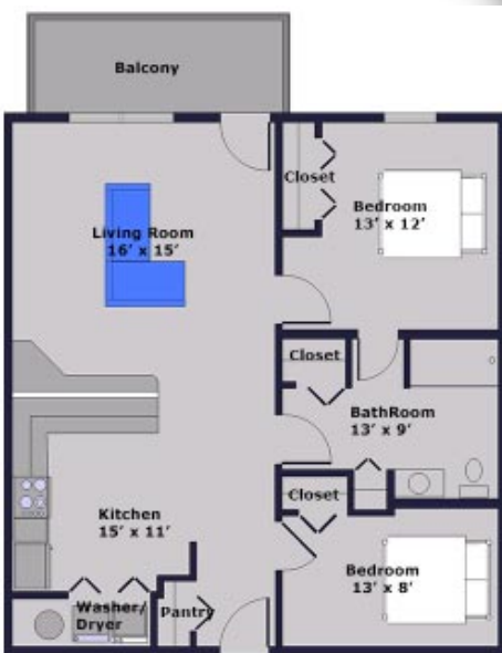
Apartment C Floor Plan Two Bedroom/One Bathroom 990 sq.ft.

Artist's rendition of typical apartment. Interior finishes are examples only. Furniture not included.