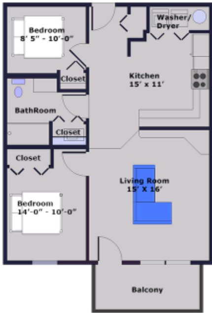
Apartment A Floor Plan Two Bedroom/One Bathroom 858 sq.ft.