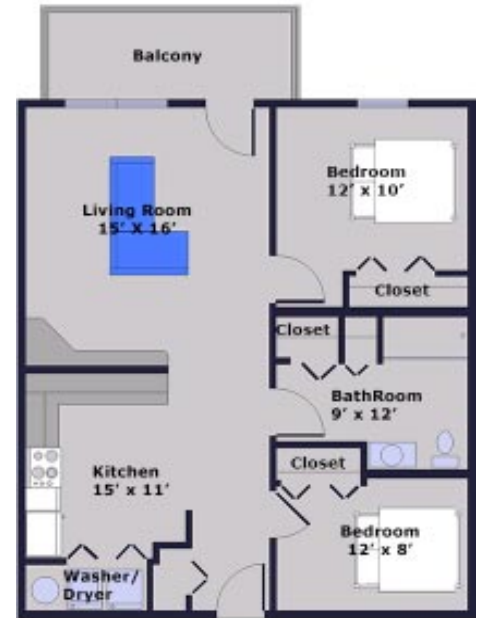
Apartment B Floor Plan Two Bedroom/One Bathroom 924 sq.ft.